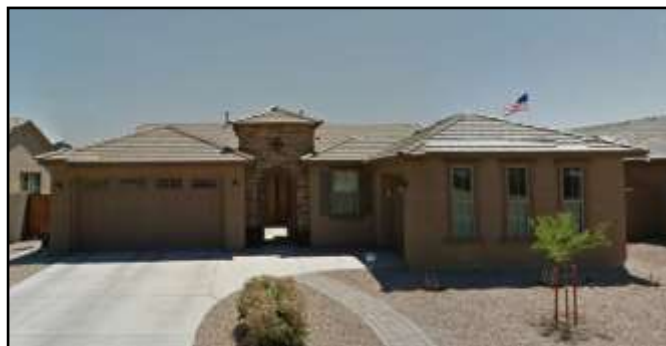
Example of a home with a side-entry garage that appears livable from street view.