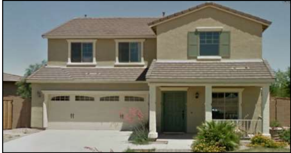
30% of the building incorporates a usable front porch.