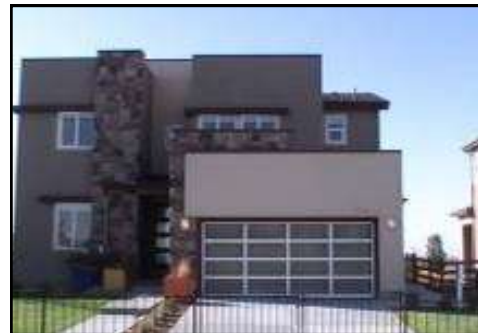
Non-conventional garage door.