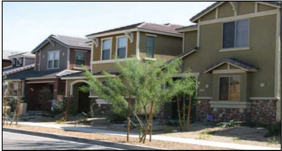
Example of homes on a block with variety of roof forms.