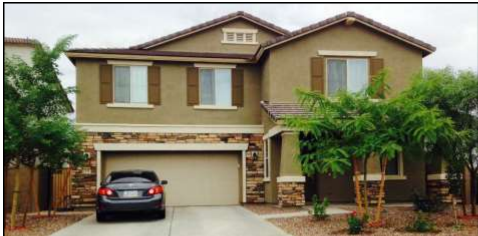
Example of a home with architectural detail as it relates to color, type, and materials.