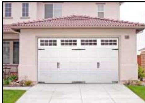
“Carriage-style” garage door.