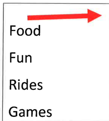
Banner Example (8' X 4')