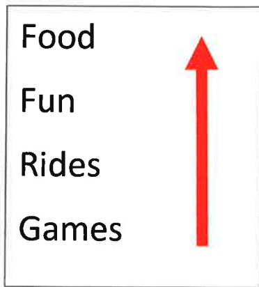
A Frame Example (20" X 28")