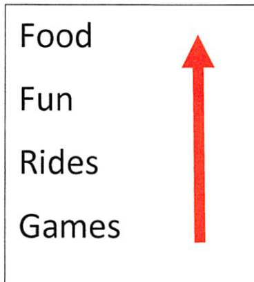
A Frame Example (20" X 28")