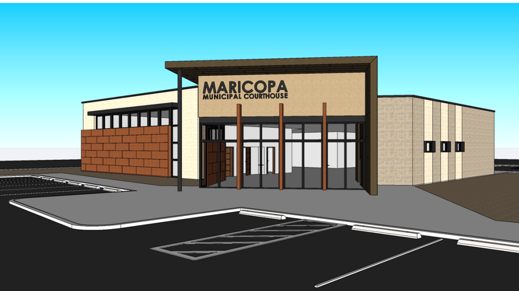
EXTERIOR – OPTION A