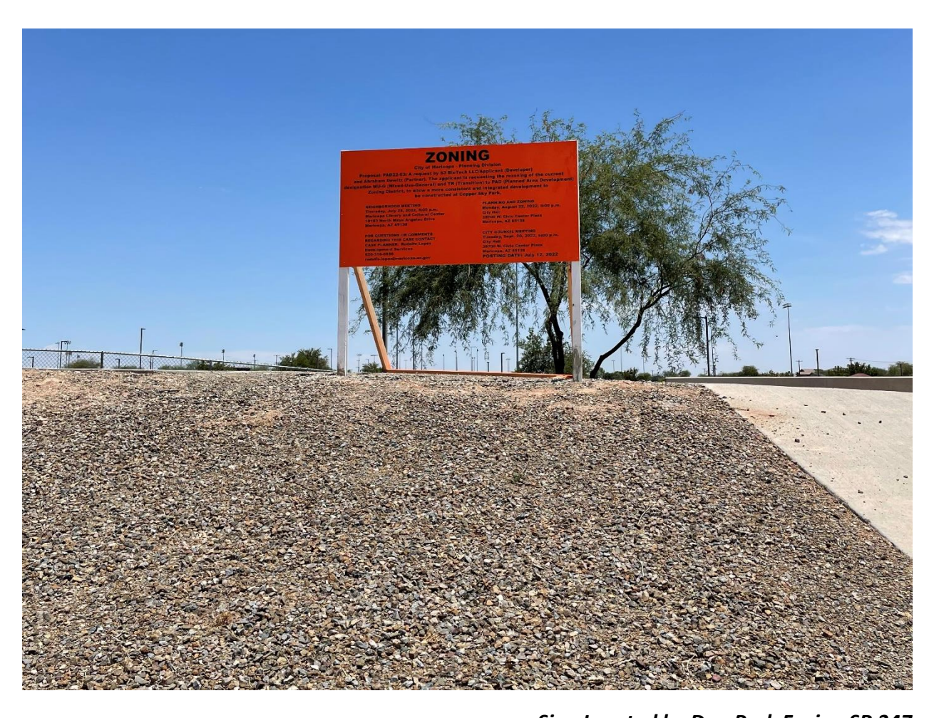
Sign Located by Dog Park Facing SR 347