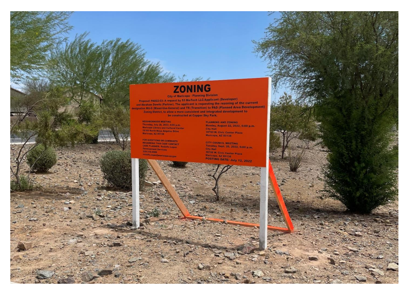
Sign Located on Corner of Bowlin and Greythorn