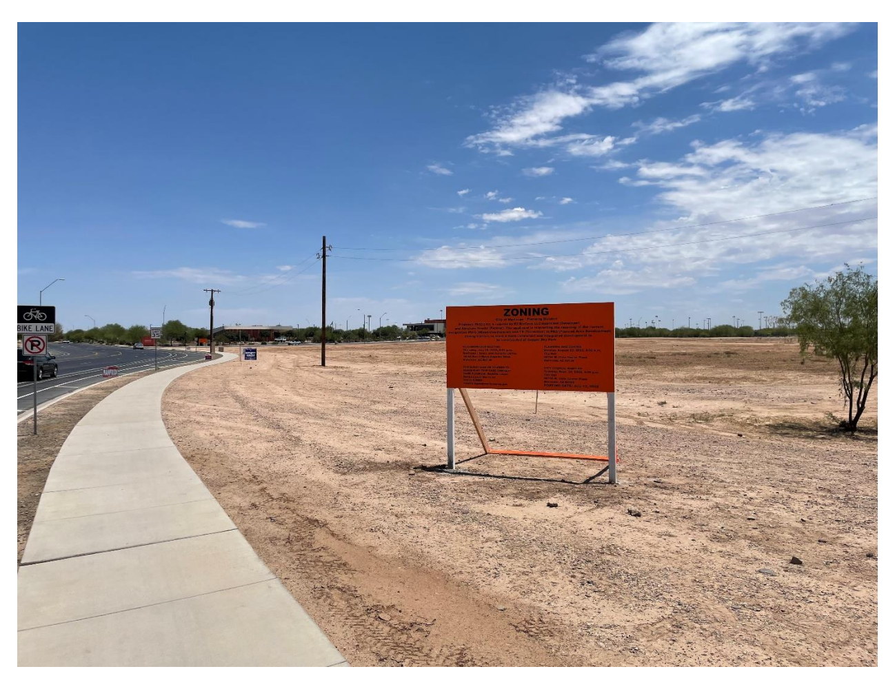
Sign Located on Corner of SR 347 and Bowlin