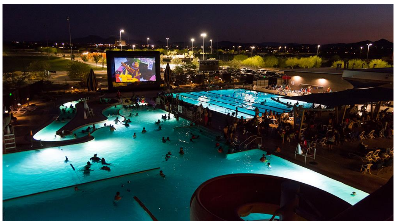
Copper Sky Aquatic Center

The City of Maricopa had the foresight over 10 years ago to acquire park land as they saw their community begin to grow. The original 110-acre facility, known as Copper Sky Recreation Complex, was planned through extensive public involvement. Copper Sky Park is the active sports complex, fitness, recreation and leisure destination for the City's residents. The site beautifully accommodates multi-use fields, a championship four-plex softball/little league baseball complex, restrooms and concession buildings, a maintenance building and a storage yard. There are also large turf areas for public events with an amphitheater and a 5-acre urban fishing lake surrounded by fishing nodes and picnic ramadas. The Park also includes a dog park, skate park, basketball courts, sand volleyball courts, tennis courts, horseshoe pits and a large playground area.