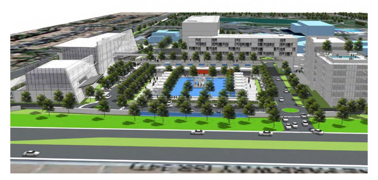
Copper Sky Medical Campus Entrance Perspective

At its ultimate build-out, the D3 Medical Campus will be able to provide effective and affordable healthcare services to the Community. The most complex cases will be referred to regional healthcare centers.