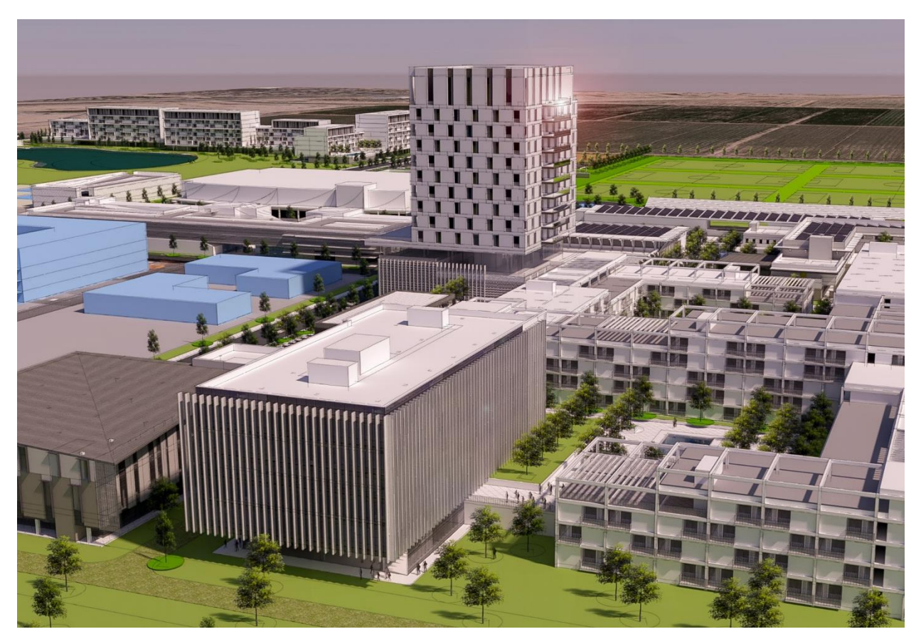
D3 Innovation Campus Perspective

With these particular properties, that objective is made more challenging by the fact that the current Park was heretofore developed by the City but must now be brought under an integrated Master Plan and development framework that is compliant with City of Maricopa zoning authority and also recognizes surrounding neighborhood goals.