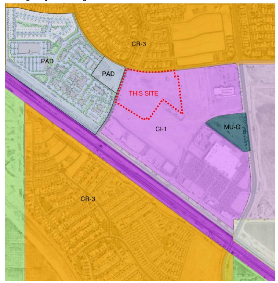
Page 3 of 7