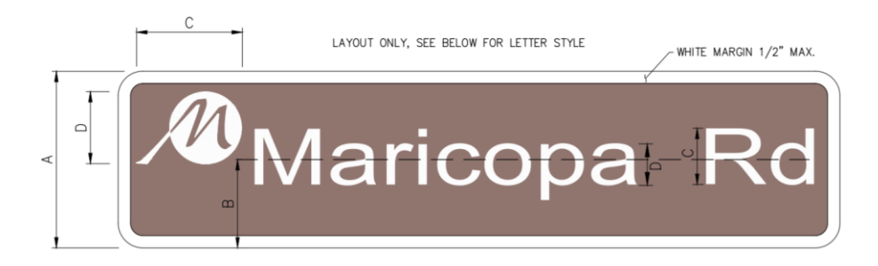
Figure 1: Current Street Name Sign Design

2. Street Name Sign MAR-230, DSM Appendix, page 77.