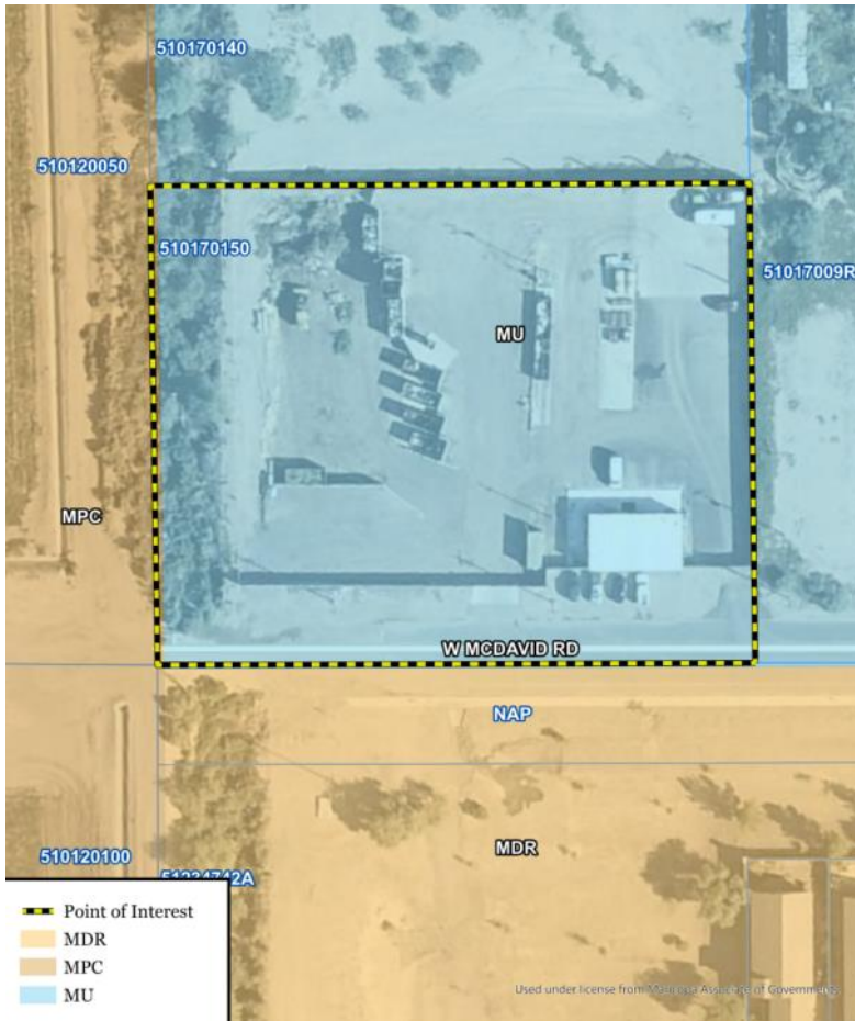
Current General Plan Land Use Map