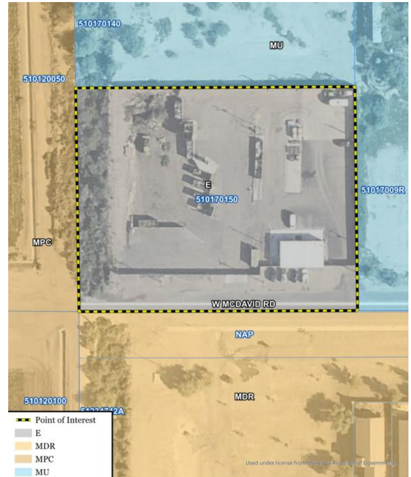
Proposed General Plan Land Use Map