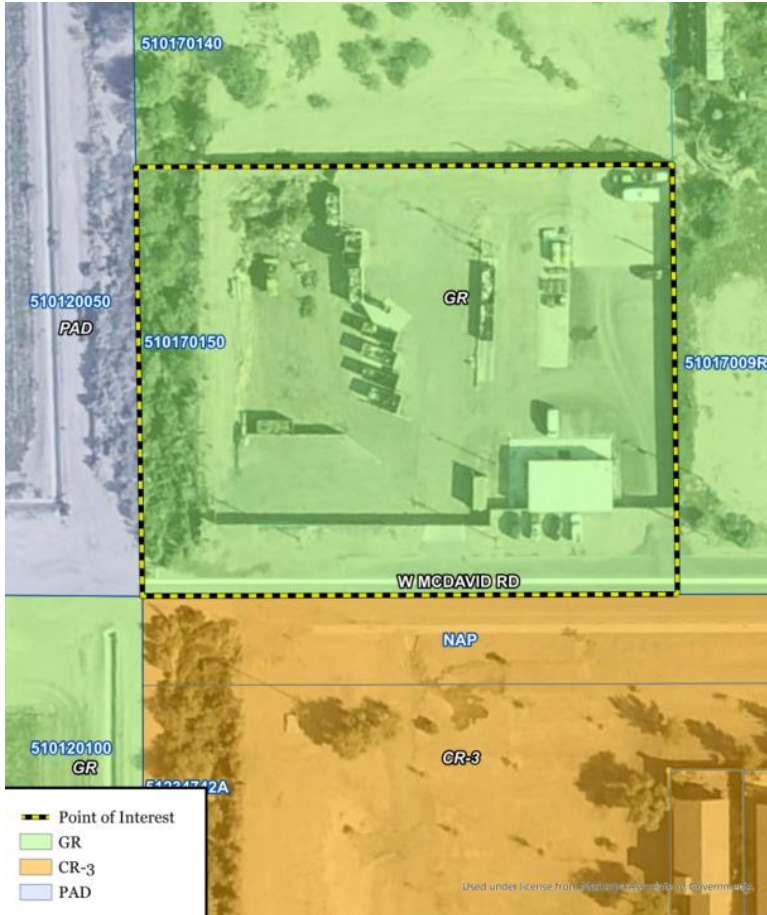
Current Zoning Map