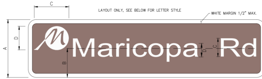
Figure 1: Current Street Name Sign Design