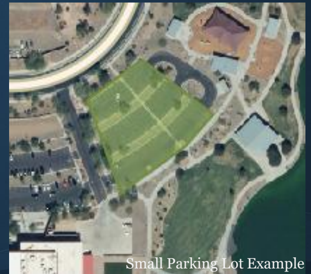
Small Parking Lot Example