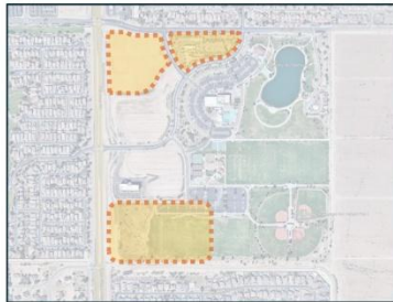
Existing PAD Boundary