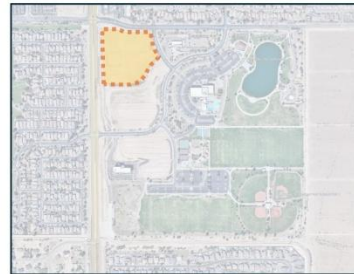
New PAD Boundary