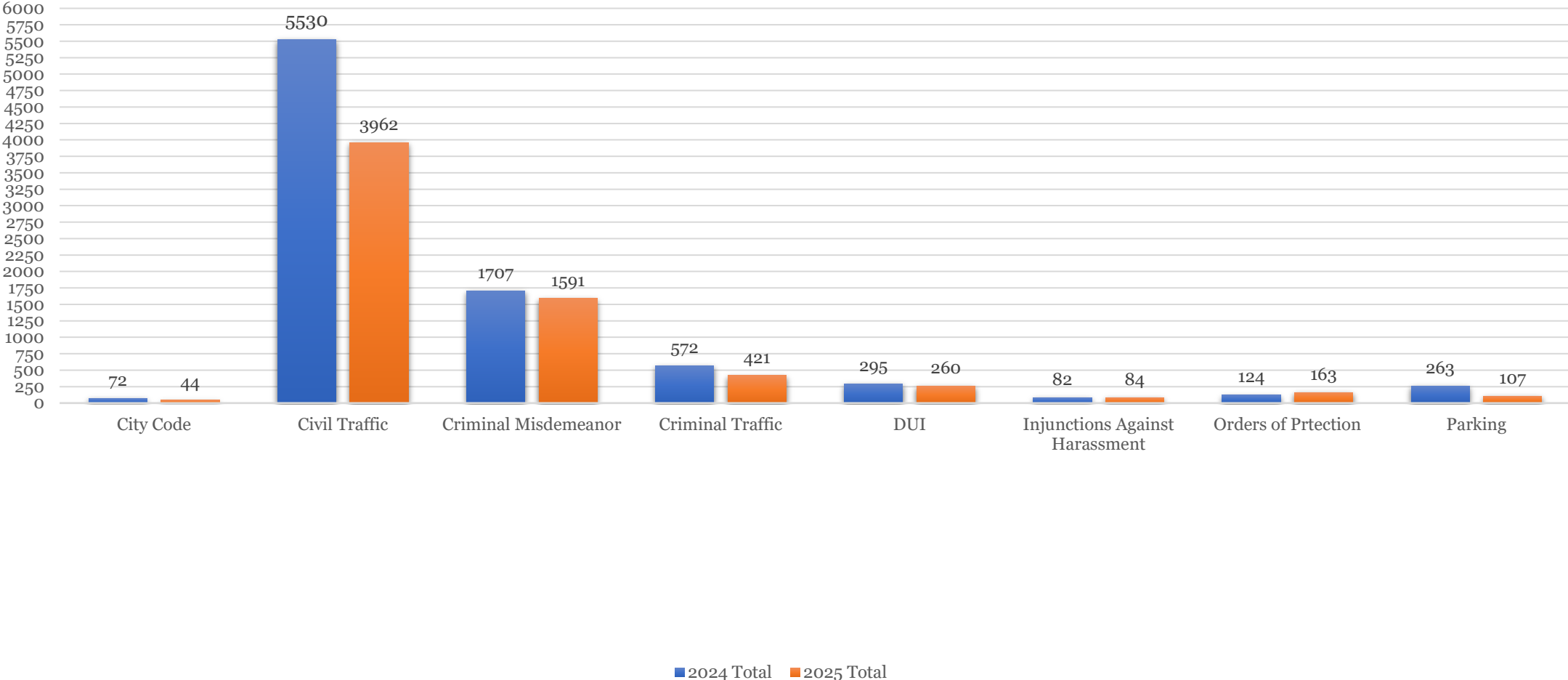
2024/2025 Case Filing Comparison by Case Type