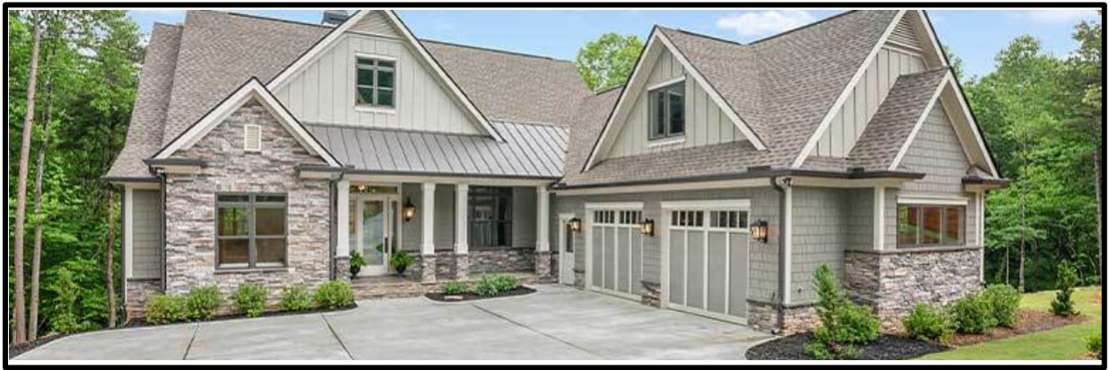
Example of a home with a side-entry garage which appears livable from street view.