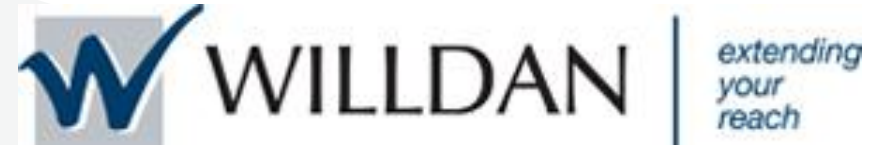
Willdan Financial Services Temecula, California