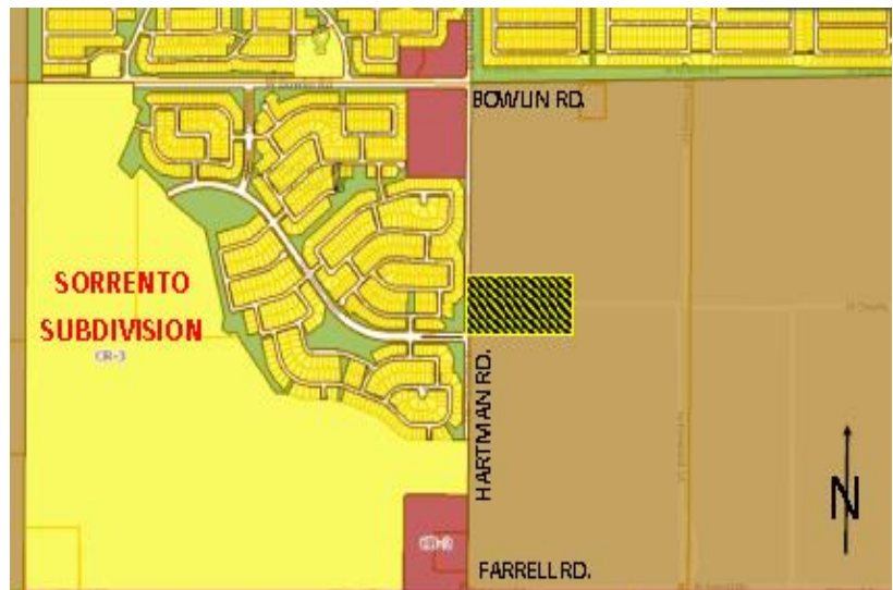
Figure 1 Subject Site

The scope of this review is for land use conformity/compatibility to the General Plan and does not include an in-depth analysis of the proposed subdivision design. Refer to Attachment A for project narrative. The property and the surrounding area is designated as a Master Planned Community (MPC). Per the General Plan, a MPC designation provides for large-scale (160 acres or more) master planned developments that includes a variety of residential products, including larger lots and smaller, attached housing, along with