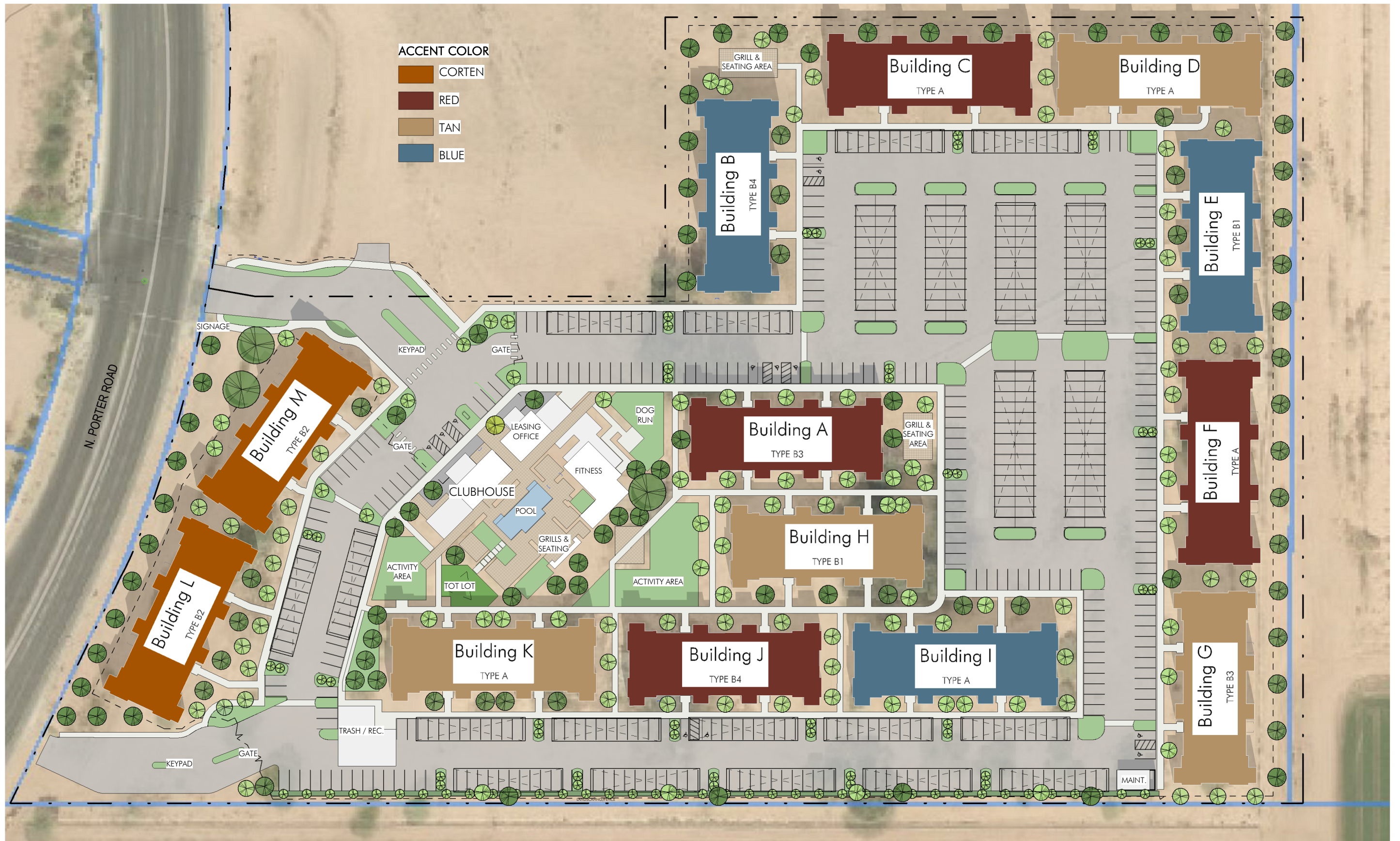
1 SD Site Plan 1" = 80'-0"