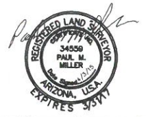
EXHIBIT "A" AMENDED MARICOPA MANOR ABANDONMENT OF COMMON LOT LINES BETWEEN LOTS 68, 69, 70, 71, 72, 73 AND LOT 41. EEC JOB NO. 14592