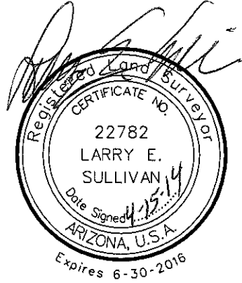
EXHIBIT G-3 N:\1780001\LAND\EH\SCTRI.DGN 4550 NORTH 12TH STREET PHOENIX, ARIZONA 85014 TELEPHONE (602) 264-6831

SANTA CRUZ NORTH CHANNEL RIGHT OF WAY EAGLE SHADOW, LLC - TRIANGLE PARCEL COE & VAN LOO PLANNING • ENGINEERING • LANDSCAPE ARCHITECTURE