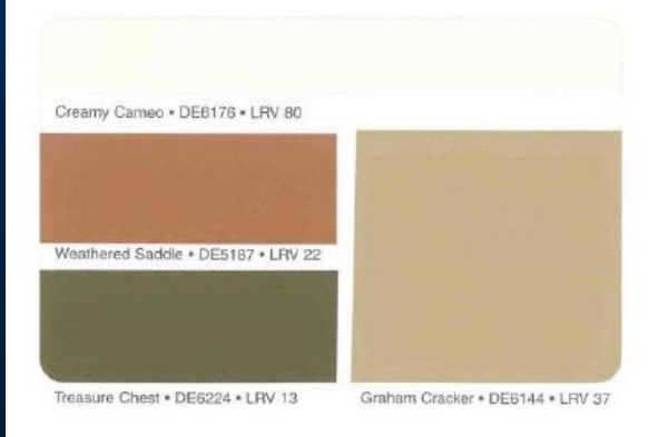
Suggested Color Pallet from Heritage District Guidelines