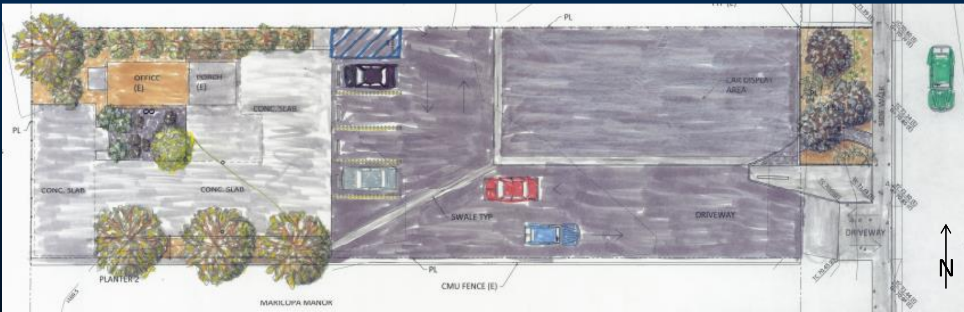
Willow Acacia