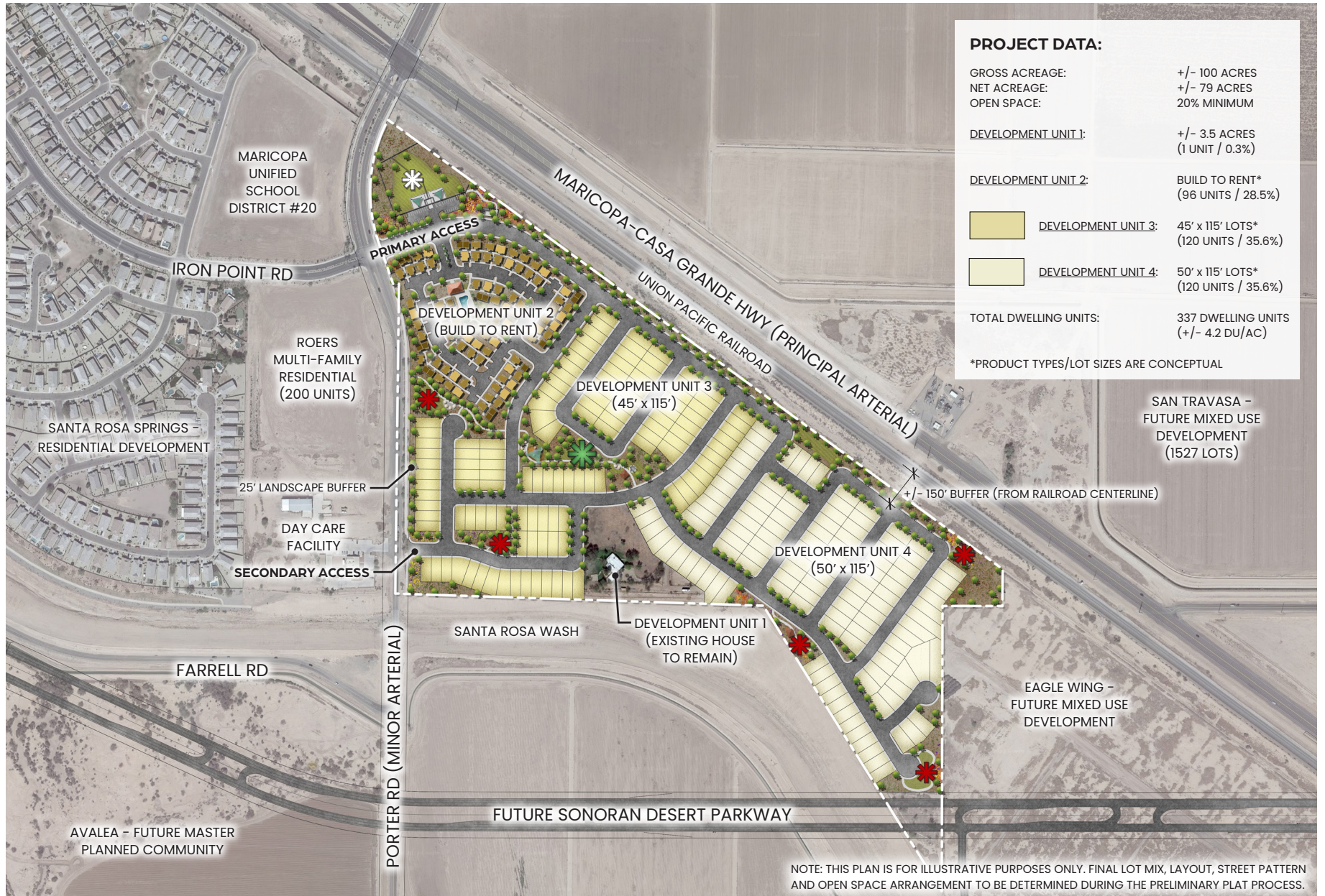
EXHIBIT 7 | CONCEPTUAL SITE PLAN