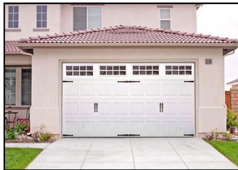
“Carriage-style” garage door.