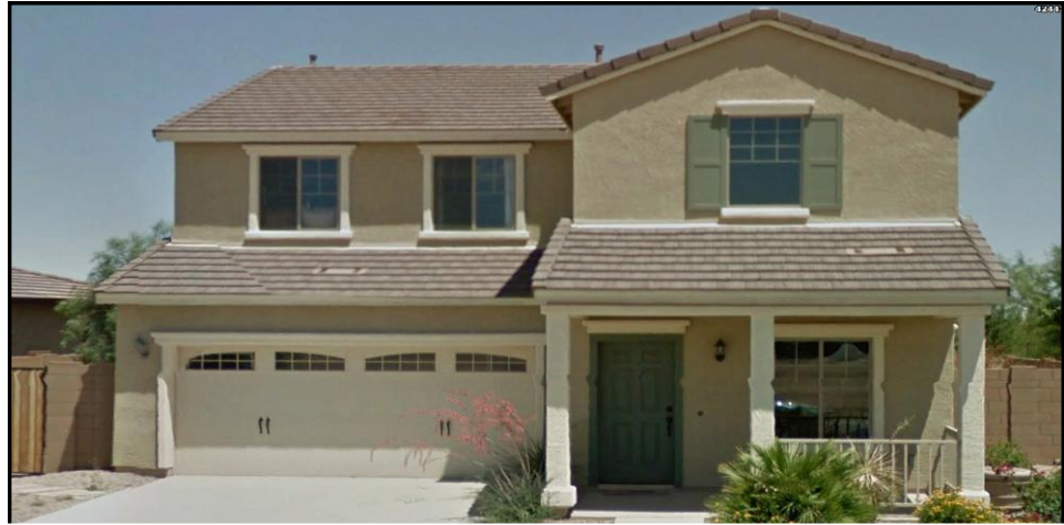
30% of the building incorporates a usable front porch.