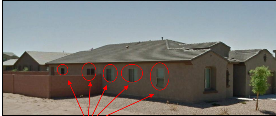
No architectural treatment around windows.