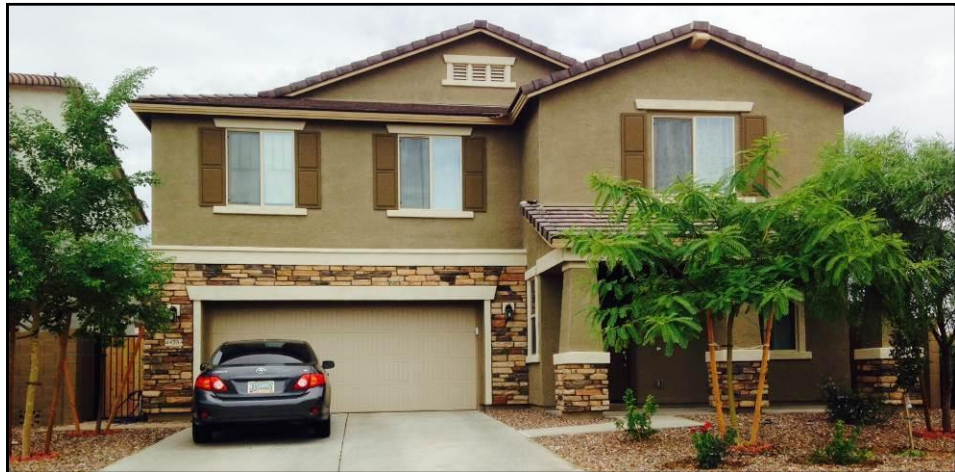
Example of a home with architectural detail as it relates to color, type, and materials.