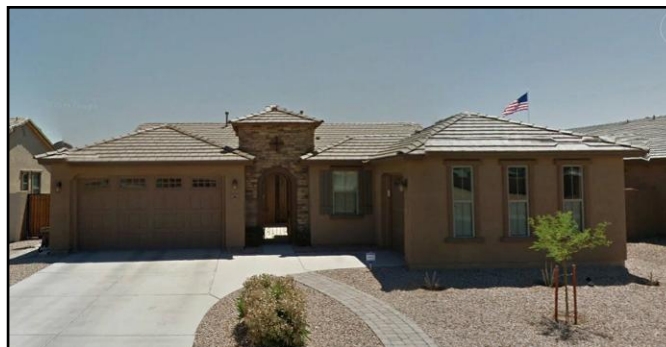
Example of a home with a side-entry garage that appears livable from street view.