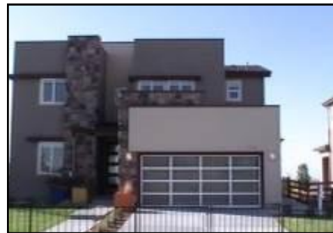
Non-conventional garage door.