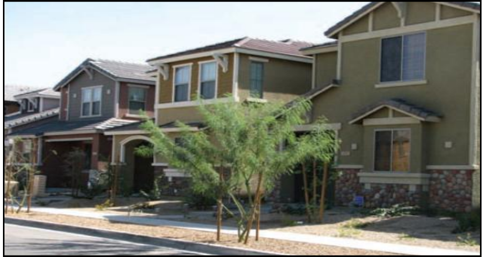
Example of homes on a block with variety of roof forms.