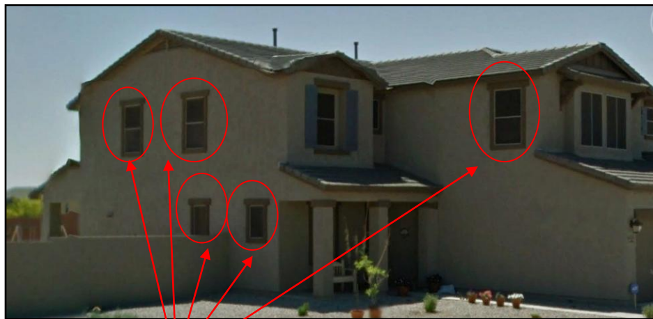
Architectural treatment around windows provided.