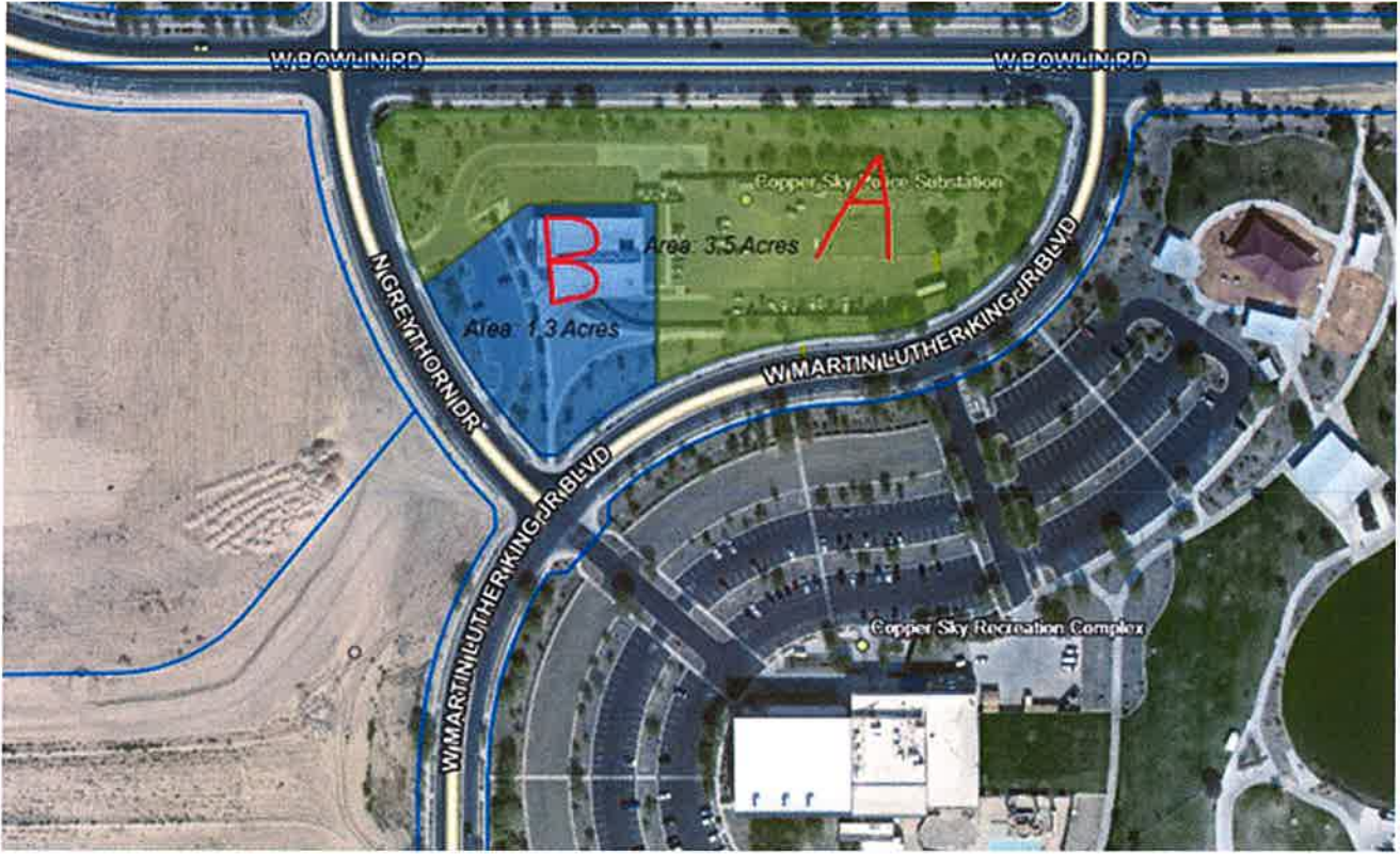
EXHIBIT A General Depiction of the Property