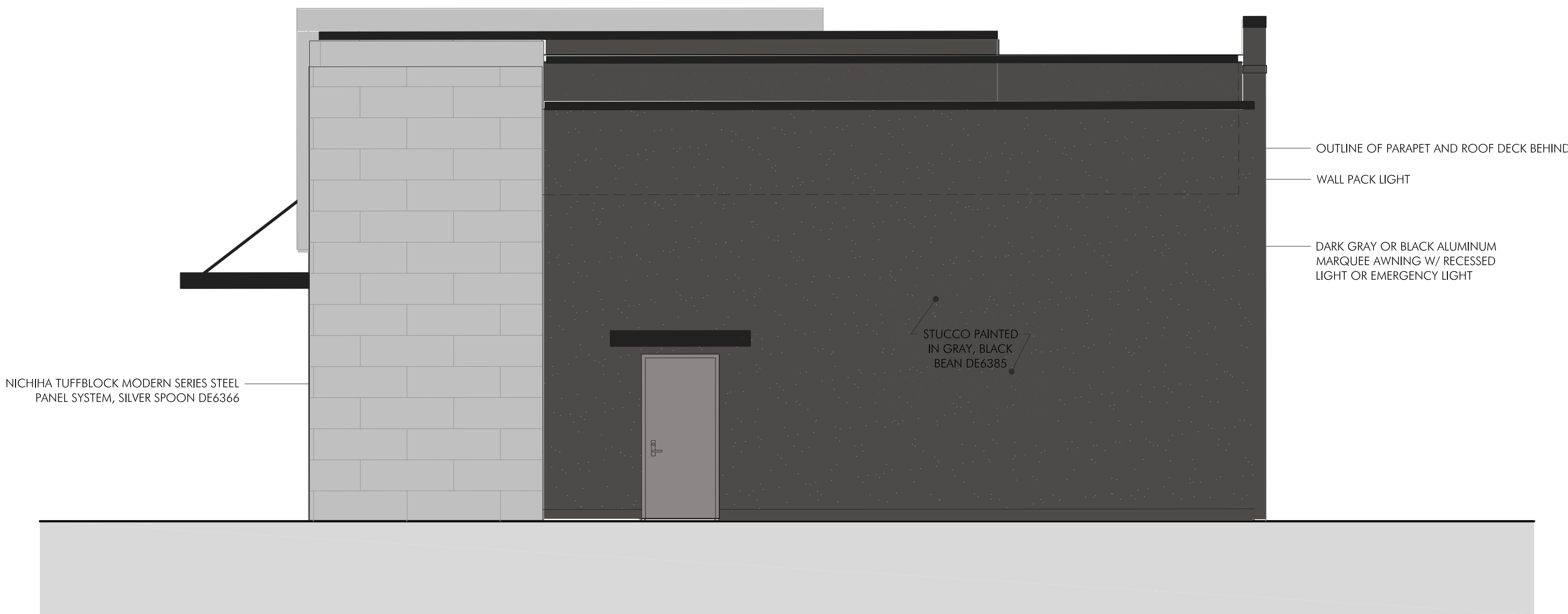
2 SIDE EXTERIOR ELEVATION SCALE: 1/4" = 1'-0"