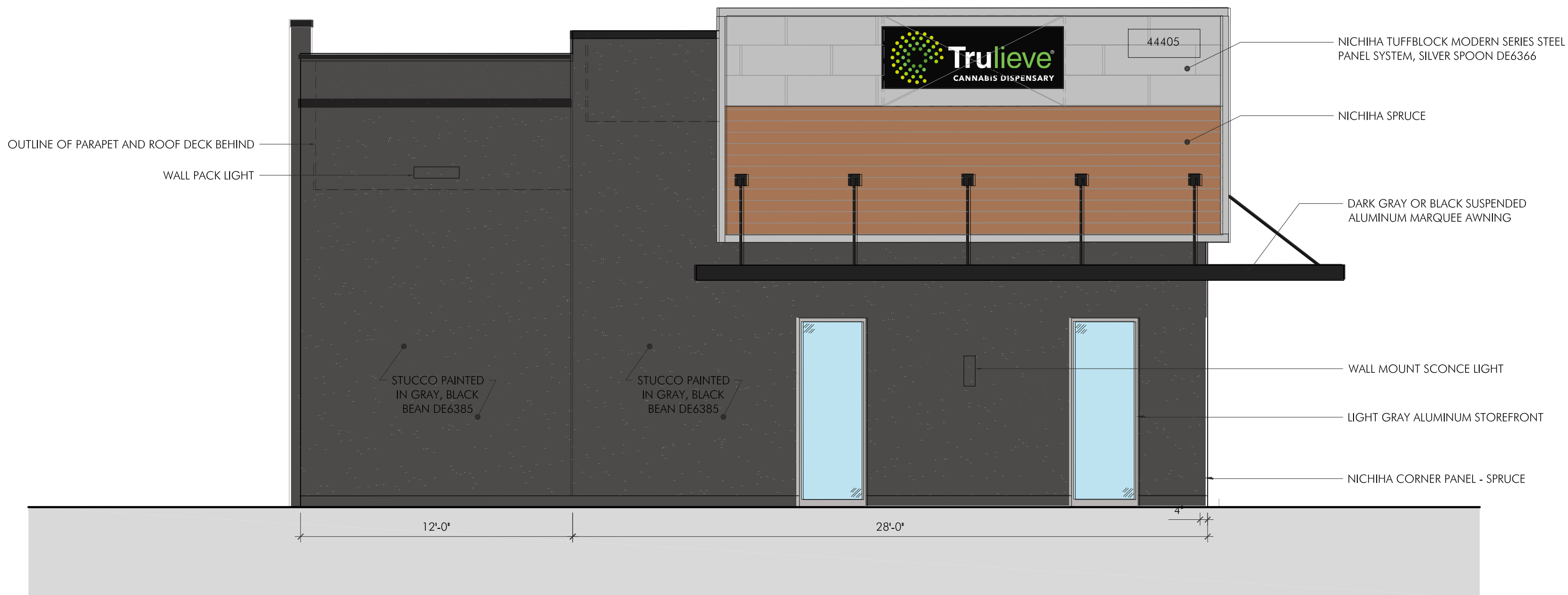
4 SIDE EXTERIOR ELEVATION SCALE: 1/4" = 1'-0"

PROJECT: NEW CONSTRUCTION DISPENSARY TRULIEVE; ATTN ROBERT JOYCE JOHN WAYNE PARKWAY EAST MARICOPA, AZ 85138