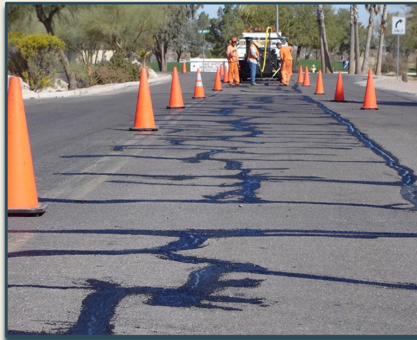
Crack Sealing Treatment