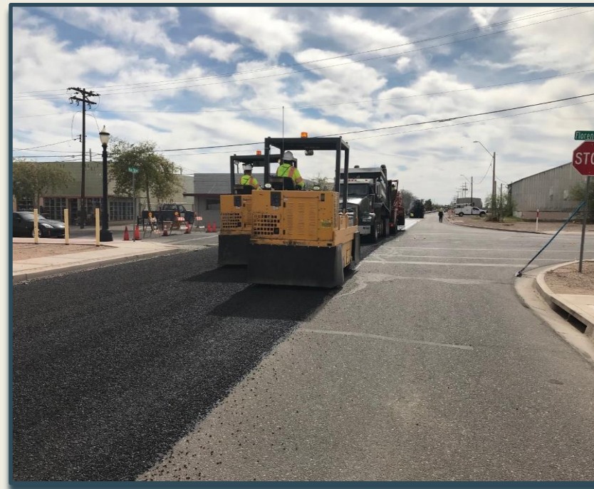
Chip Seal Projects